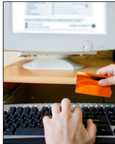
With Sage SPS you can process credit card transactions via the Web directly from within Sage MAS 90.

The credit card processing industry is rapidly changing, and new rules and regulations are frequently being added in order to reduce fraud and protect sensitive customer information. This means you must stay on top of the changes and be diligent in downloading upgrades to your software as the changes occur. With Sage Payment Solutions, you are ensured that you are up-to-date and in compliance. Keeping up