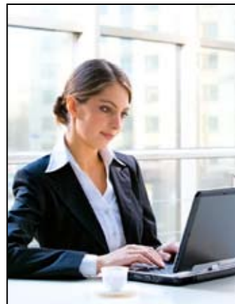
Give your staff the data they need for informed decision making with FRx.

The need for financial accountability is greater than ever—driven by standards such as Sarbanes-Oxley. Financial reports should no longer be simply printed and filed until audit or tax time. Included with every Sage MAS 90 ERP General Ledger is Microsoft FRx Report Designer (FRx), an industry-standard financial reporting tool. Taking full advantage of FRx, you can share information and encourage fiscal responsibility at all levels of the organization. It is easy to build and format financial reports within FRx. In this article, we'll cover tips for getting the most out of FRx and then we'll take a brief look at the add-on solutions available for FRx, including templates from Sage Extended Solutions.